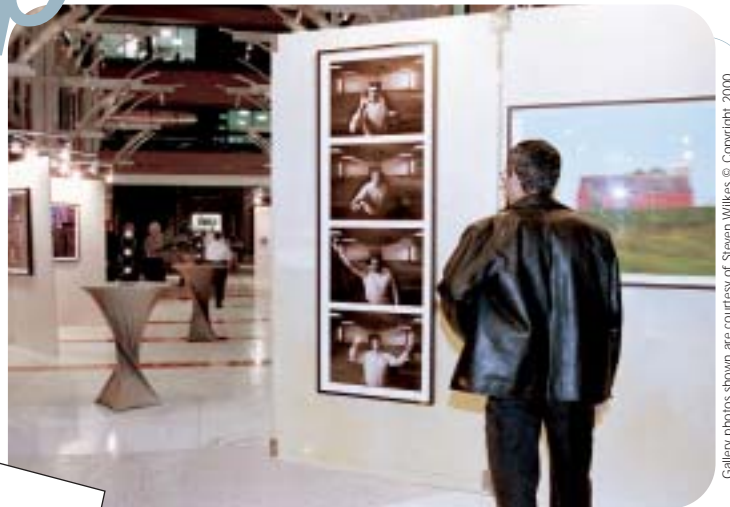
Gallery photos shown are courtesy of Steven Wilkes. © Copyright 2000

Imagine being able to produce everything from the most demanding outdoor signage to frame-worthy fine art and photography by simply changing the media. There's no need to purchase and maintain multiple output devices. The EPSON Stylus Pro 10000 handles it all.